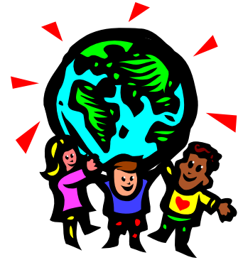
Earth Day Celebration April 22

If you've been worried the fate of our wonderful Habitat Garden during renovations, rest easy. We are currently planning to move the plants over to the new wing of Pyle, let them grow there a bit, then return some of the plants when Carderock is finished - and add some new plants! The move will be a huge undertaking and we will need many volunteers from the Pyle and Carderock communities. Stay tuned and watch for announcements in the fall.